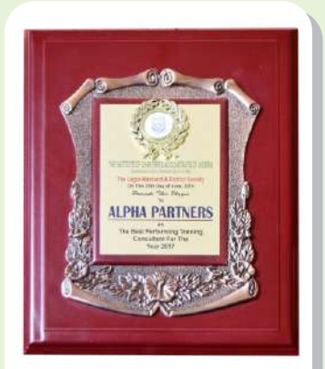
ICAN Best Performing Training Consultant Award 2017