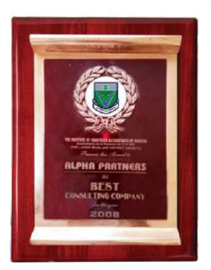
ICAN Best Training Consultant Award 2008