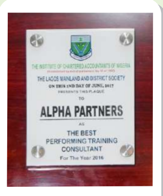
ICAN Best Performing Training Consultant Award 2016