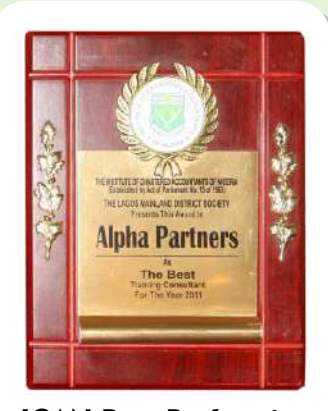
ICAN Best Performing Training Consultant Award 2011