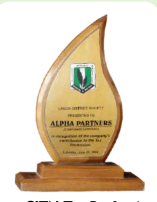
CITN Tax Profession Recognition Award 2002