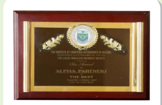
ICAN Best Performing Training Consultant Award 2010