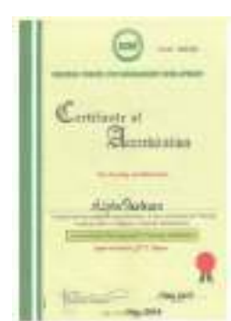
Certificate of Accreditation NCMD