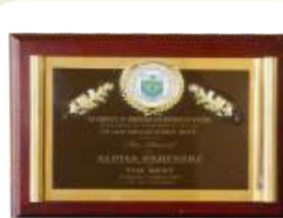
ICAN Best Performing Training Consultant Award 2010