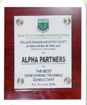
ICAN Best Performing Training Consultant Award 2016