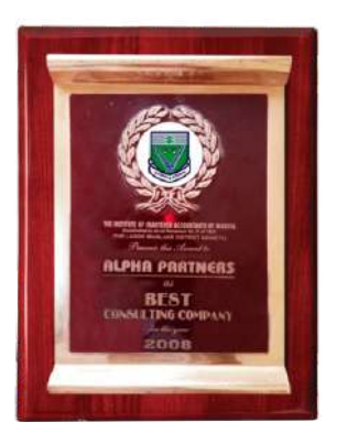
ICAN Best Training Consultant Award 2008