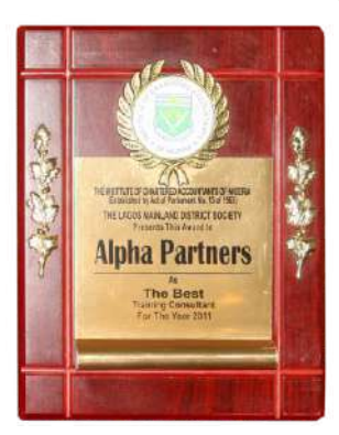
ICAN Best Performing Training Consultant Award 2011