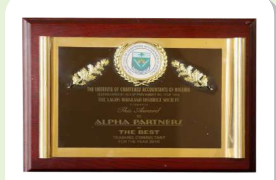
ICAN Best Performing Training Consultant Award 2010