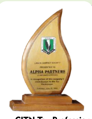
CITN Tax Profession Recognition Award 2002