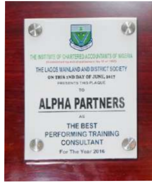
ICAN Best Performing Training Consultant Award 2016