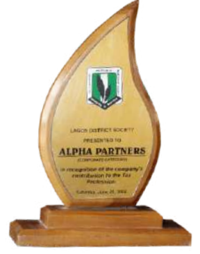
CITN Tax Profession Recognition Award 2002