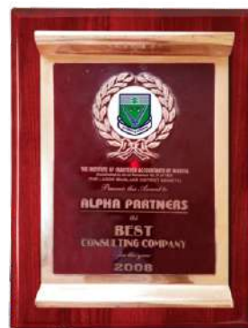
ICAN Best Training Consultant Award 2008