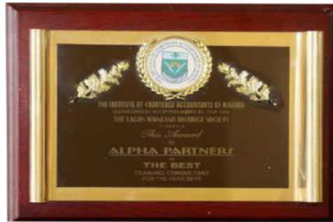
ICAN Best Performing Training Consultant Award 2010