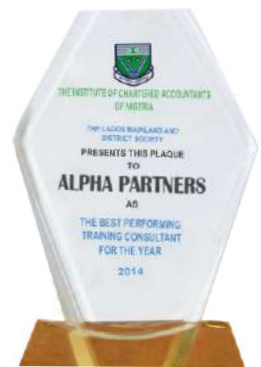
ICAN Best Performing Training Consultant Award 2014