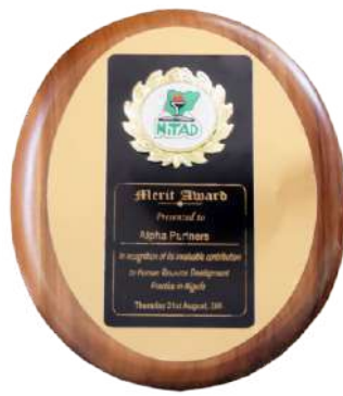
NITAD Human Resource Development Merit Award 2000