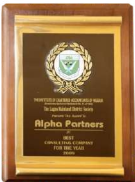
ICAN Best Performing Training Consultant Award 2009