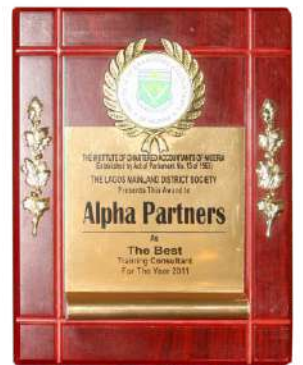
ICAN Best Performing Training Consultant Award 2011