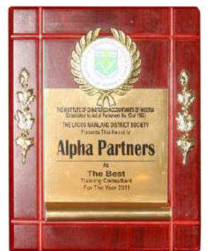
ICAN Best Performing Training Consultant Award 2011