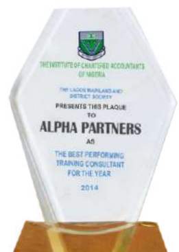
ICAN Best Performing Training Consultant Award 2014