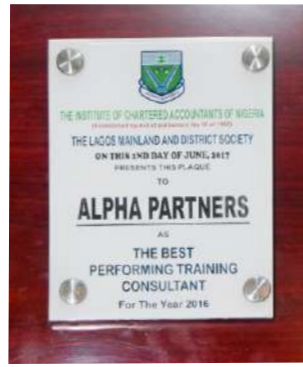
ICAN Best Performing Training Consultant Award 2016