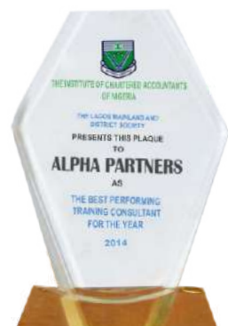
ICAN Best Performing Training Consultant Award 2014