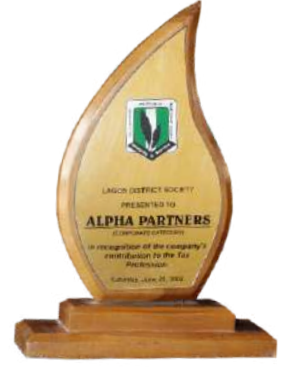
CITN Tax Profession Recognition Award 2002