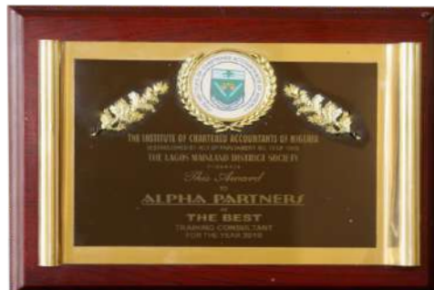
ICAN Best Performing Training Consultant Award 2010