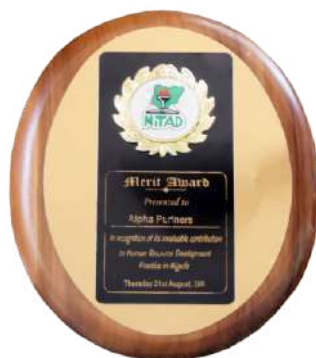
NITAD Human Resource Development Merit Award 2000