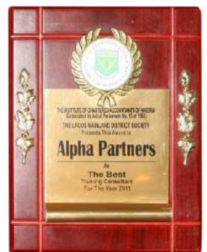
ICAN Best Performing Training Consultant Award 2011