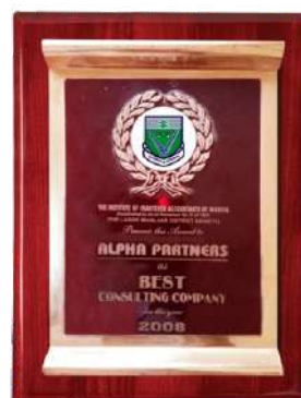
ICAN Best Training Consultant Award 2008