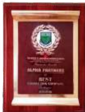
ICAN Best Training Consultant Award 2008