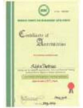
Certificate of Accreditation NCMD