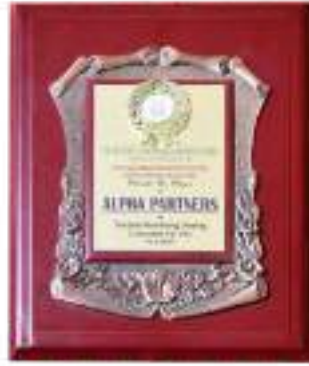
ICAN Best Performing Training Consultant Award 2017