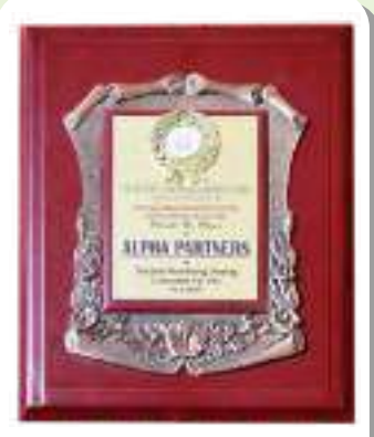
ICAN Best Performing Training Consultant Award 2017