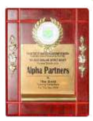
ICAN Best Performing Training Consultant Award 2011