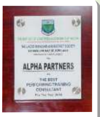
ICAN Best Performing Training Consultant Award 2016