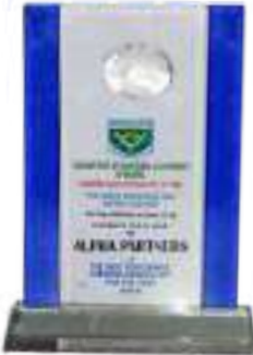
ICAN Best Performing Training Consultant Award 2015