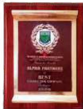
ICAN Best Training Consultant Award 2008