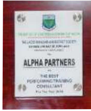
ICAN Best Performing Training Consultant Award 2016