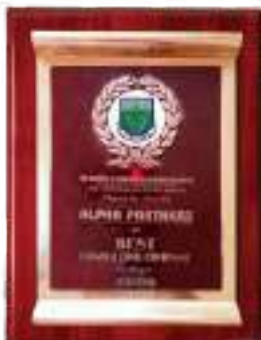
ICAN Best Training Consultant Award 2008