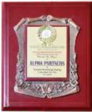
ICAN Best Performing Training Consultant Award 2017