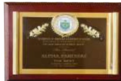
ICAN Best Performing Training Consultant Award 2010