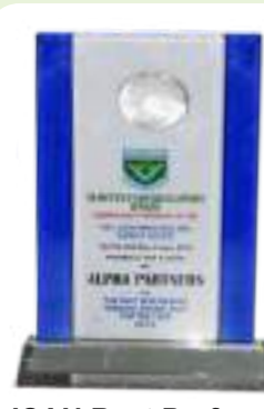
ICAN Best Performing Training Consultant Award 2015