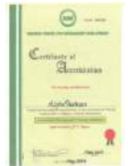
Certificate of Accreditation NCMD