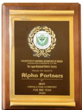
ICAN Best Performing Training Consultant Award 2009