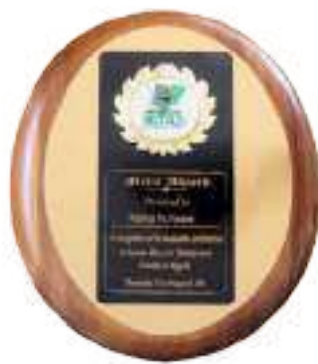
NITAD Human Resource Development Merit Award 2000